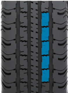
Low noise — precise spacing and angle block design.