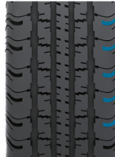
Wide and deep design on the shoulder offer more grip performance and heat release.