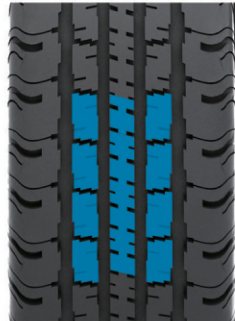
Grip — width variation design pattern groove.