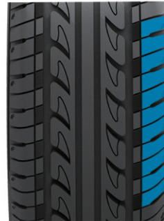
Split Type Shoulder Block Design