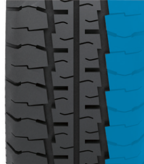
Interlaced Tread Pattern Block The interlaced tread pattern block on tyre shoulder can promote the cross-country performance of tyres.