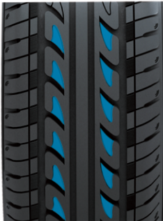
Shark Fin Tread Pattern