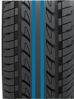
Small Knurl Design on Side Wall of Groove It can eliminate the pumping generated between the groove and ground and reduce the driving noise.