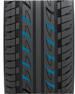
The six horizontal steps equally distributed can effectively decompose the pumping noise source, reduce noise, greatly promote the rigidity between the tread pattern blocks and eliminate sundries in the groove.