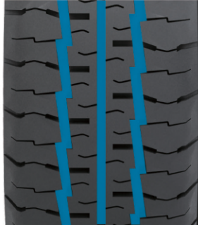
Three Longitudinal Grooves The three longitudinal grooves greatly enhance the drainage of tyres on wet land.