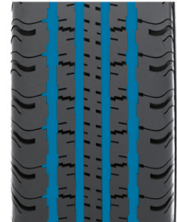
Four straight lines offer the good drainage performance.